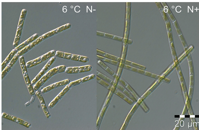
Under nitrate depletion (N-) large lipid globules are produced, none, however, under a sufficient provision with nitrate (N+).